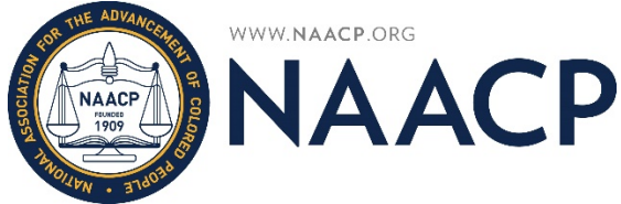
Maryland State Conference of the NAACP