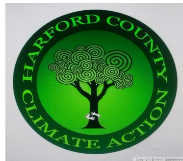
Howard County Climate Action