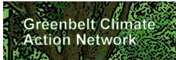
Greenbelt Climate Action Network