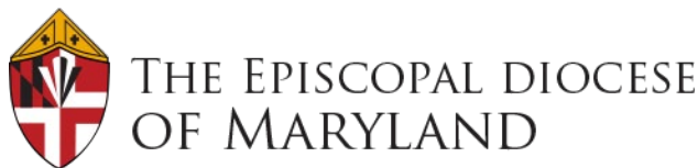
The Episcopal Diocese of Maryland